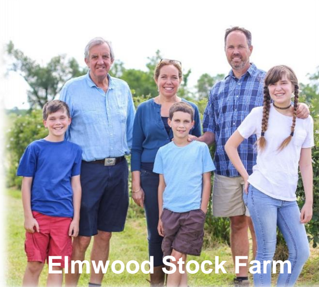
Elmwood Stock Farm