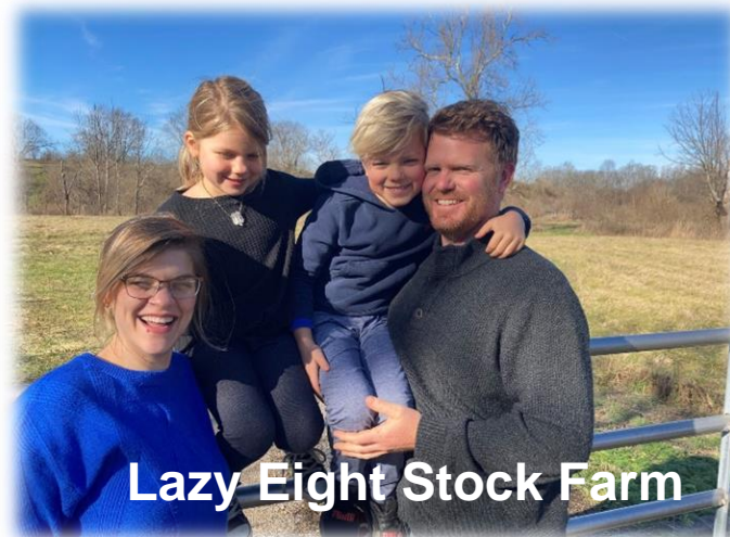
Lazy Eight Stock Farm