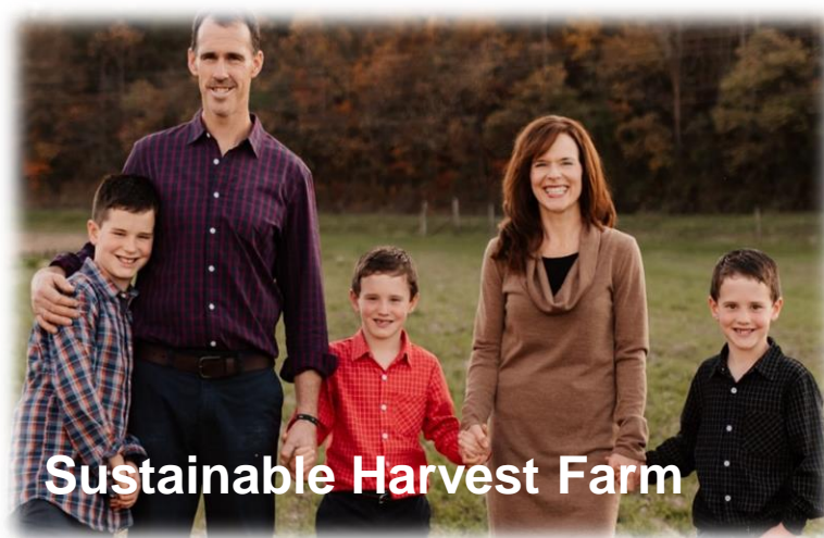
Sustainable Harvest Farm